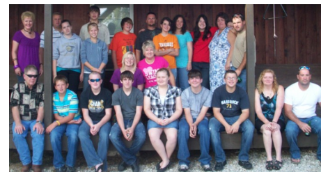
34 Youth from Boma traveled to KY to work at the Hope Hill Children's Home.

Please keep these churches in your prayers.