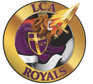
Lewisburg Christian Academy School Logo

Recently the local newspaper in Lewisburg featured an article about the merger of LifeSong Family Church of Chapel Hill and Grace Church of Chapel Hill (an independent, non-denominational church). Following several months of prayer and conversation the two churches united as one under the direction of LifeSong Family Church in Lewisburg. Moving toward a plan to plant churches in Chapel Hill, Columbia, Pulaski, Fayetteville and Shelbyville, LifeSong Family Church was launched in Chapel Hill last August. The uniting of the two congregations brings together about 150 persons into a growing fellowship with a clear mission of reaching their community for Christ. LifeSong Church is also scheduled to open Lewisburg Christian Academy this fall with classes for kindergarten and first grade. Their expectation is that within three years they will be operating a full k-12 private non-denominational Christian school.